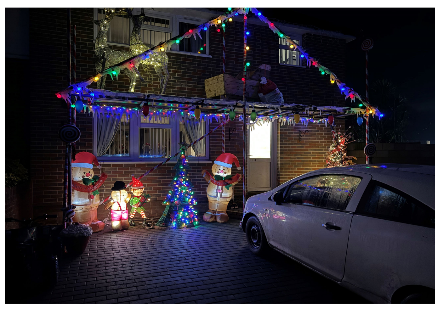
3rd Place: 7 Plantation Close