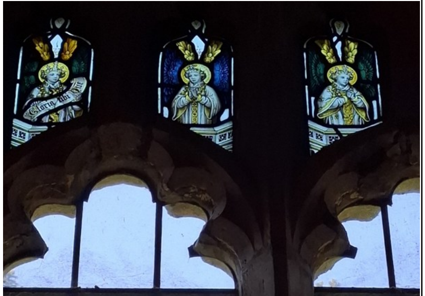
The only remaining stained glass on the north side of the church